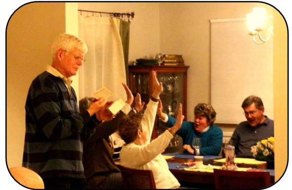
The Hollendursky Team wins one!