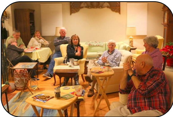
The Townsend Team ponders questions