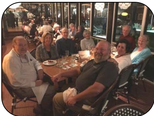
East Coast Florida Brunch