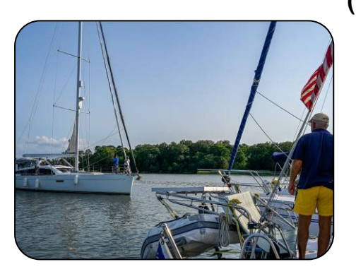
s/v Sojourner entering the raft