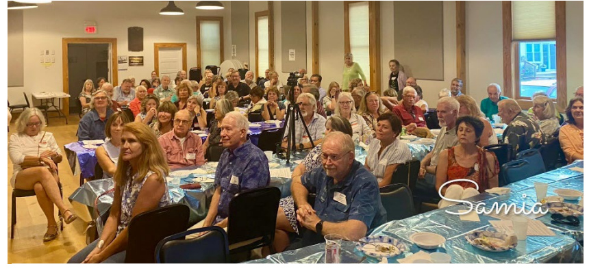
Members listen to Board Candidates' presentations.