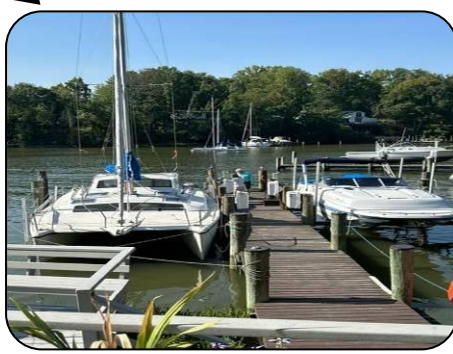
S/V Gemini at a dock.